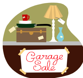
Alison is ready to handle the transaction ..